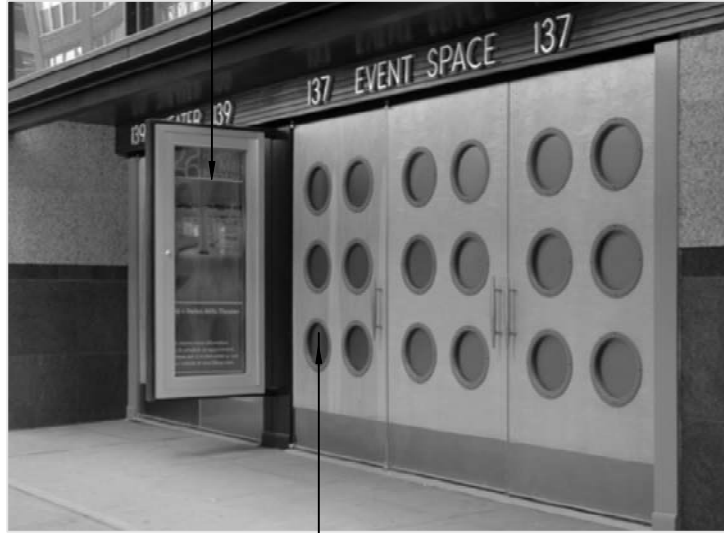
SIDEWALK SHOWCASE DISPLAY (see Diagram 3 on this page for dimensions)