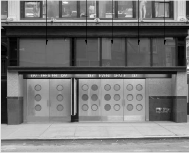
BUILDING WINDOW POSTERS (see Diagram 2 on this page for dimensions)